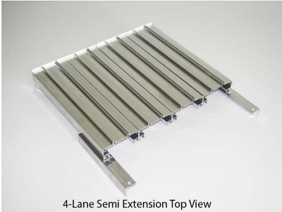
4-Lane Semi Extension Top View