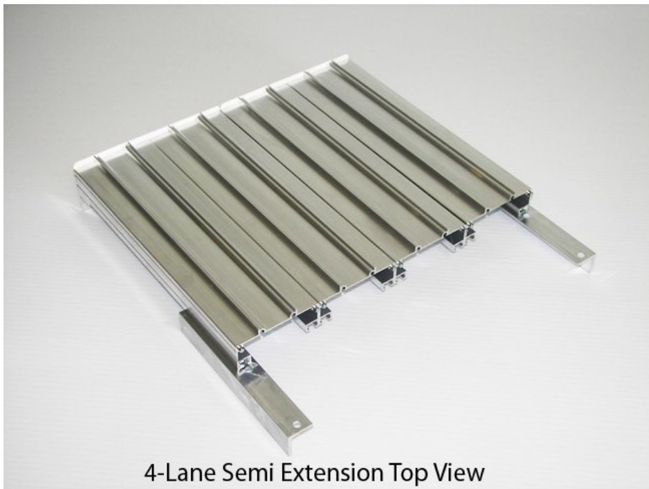
4-Lane Semi Extension Top View